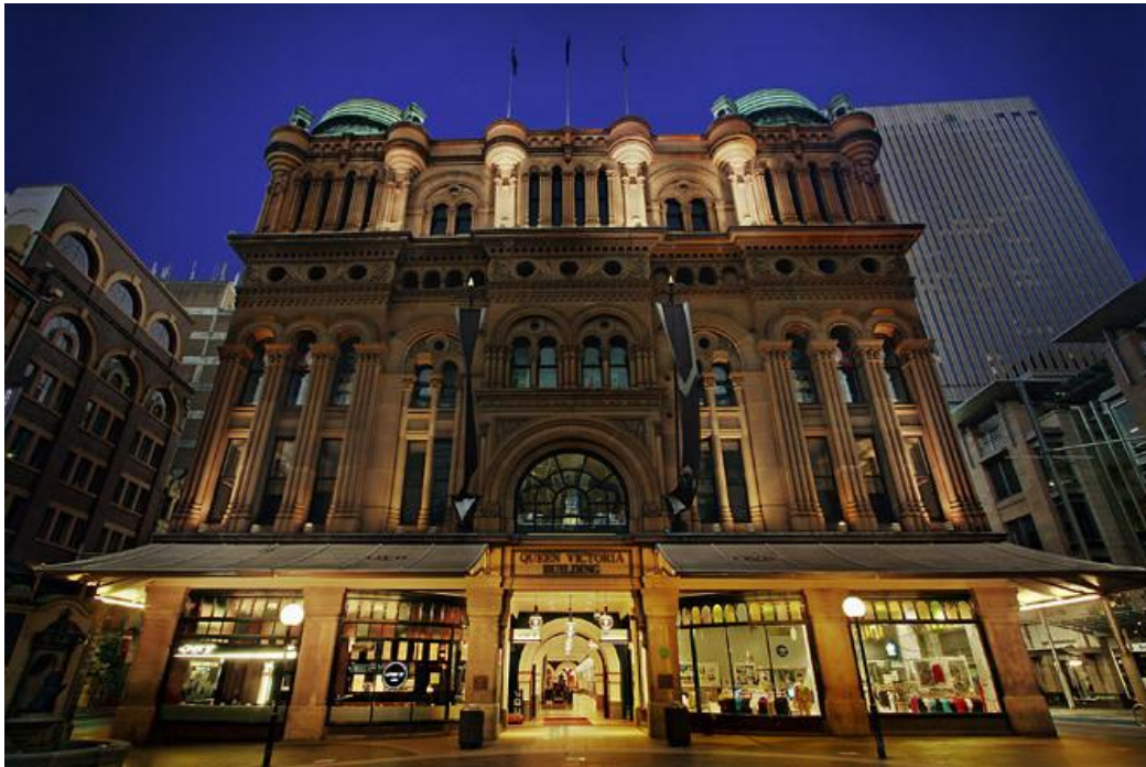
Historic Queen Victoria Building, Information at http://www.qvb.com.au/Homepage